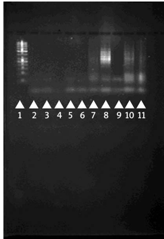
Figure 1. Agarose gel showing RFLP for TGF-β1 genotypes at codon 10. Lane 1 shows 123 bp DNA ladder lanes 1, 2, 3, 4, 5, 6 and 9 show Leu-Leu genotype and lanes 7, 8, 10 and 11 show Pro-Leu genotype

distributions of TGF-β1 gene genotypes in group 1 (COPD) according to the stages of COPD. From 7 cases with the Pro-Leu genotype, 5 (71.4%) were in stage II and 2 (28.6%) in stage III, compared to one case from 18 (5.5%) with the Leu-Leu genotype in stage II, 12 (66.7%) in stage III and 5 (27.7%) in